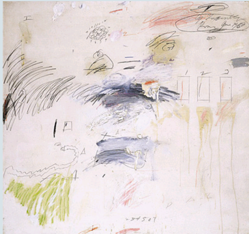
Cy Twombly, Untitled , 1960.

Barthes reiterates this idea when he writes about the "displaced" canvases of the artist Cy Twombly, whose somewhat jagged and sparse paintings often feature faintly written words or phrases - chicken-scratch traces of some absent or forgotten meaning. [9]