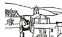
Cargèse Institute of Scientific Studies