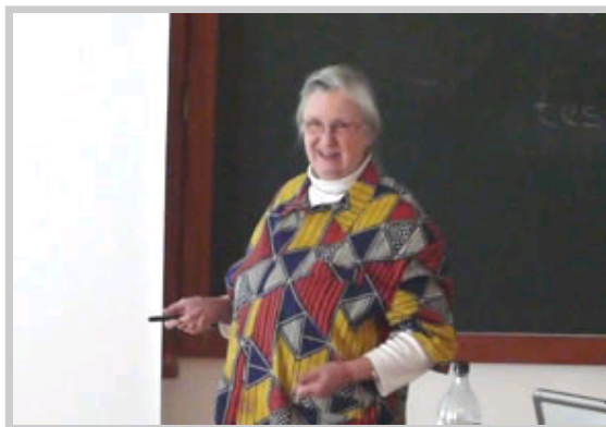
Elinor Ostrom in a Cargese workshop in February 2008

New-Institutional Economics has been developing by favoring and benefitting from cross-fertilization between economics and other disciplines. ESNIE congratulates the 2009 laureates of the Nobel Prize in Economics that demonstrated so convincingly how this approach to economics and policymaking is fruitful and relevant.