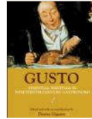
Gusto: Essential Writings in Nineteenth-Century Gastronomy