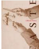
Taste: A Literary History