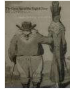
The Great Age of the English Essay