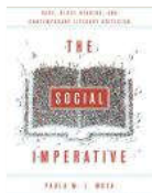
The Social Imperative: Race, Close Reading, and Contemporary Literary Criticism