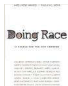
Doing Race: 21 Essays for the 21st Century