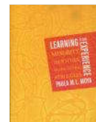
Learning from Experience