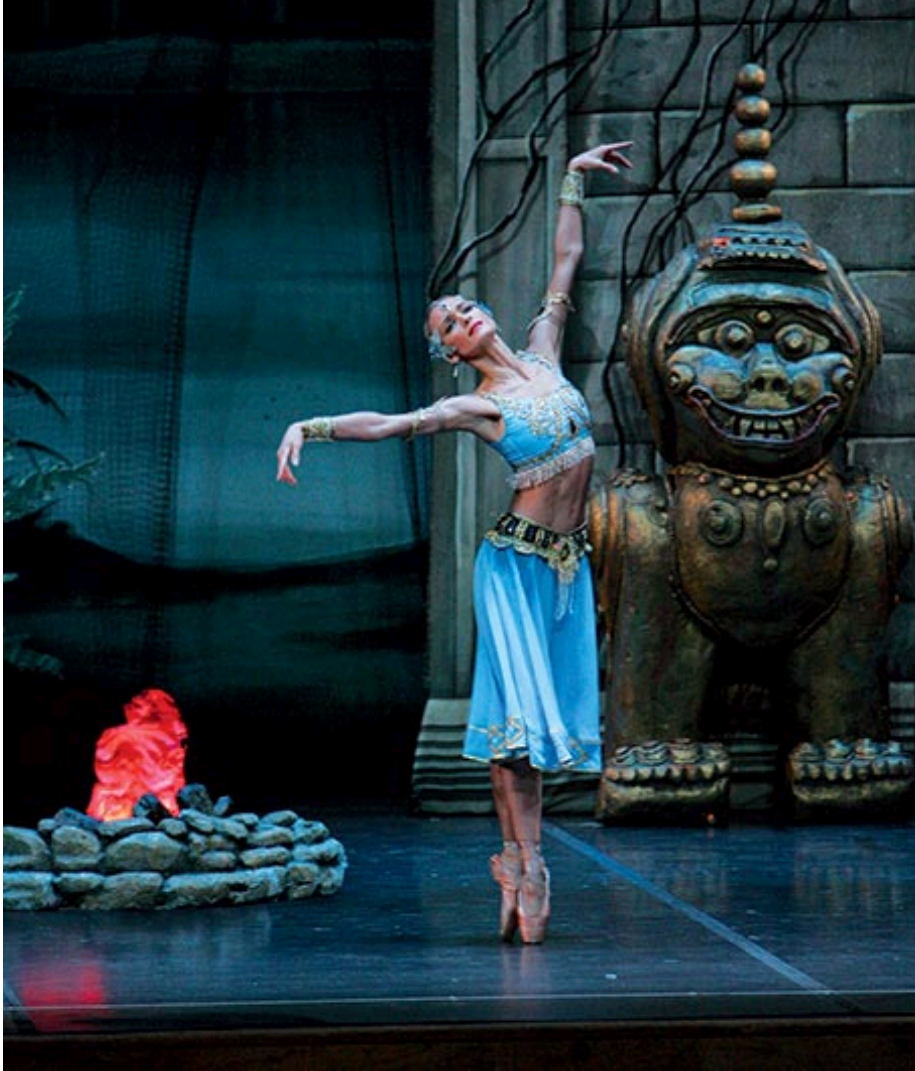
Irina Kolesnikova as Nikiya in La Bayadere