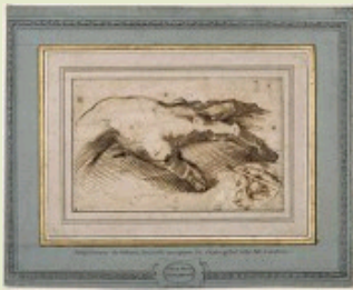
Fig. 10. Michelangelo Buonarroti (attributed), Study of one hand drawing another , 15th/16th cent. Ink on paper. Paris, Musée du Louvre, Cabinet des Arts Graphiques.

We are free, of course, to agree or disagree with both the accuracy and the appropriateness of Edmond's comparisons, but the trend—hardly unique to Goncourt—to see Japanese art through the lens of European art can also be identified in other writers, in spite of the suppositions of exoticism and difference. 70 Louis Gonse, a specialist in medieval art and author of the first general history of Japanese art, published in 1883, tended to make comparisons between Japanese art and French medieval art. 71 Moreover, Gonse concentrated on older Japanese art, compared to Edmond, who favored the art of the late eighteenth and early nineteenth centuries. Philippe Burty, Ernest Chesneau, and Zacharie Astruc, all defenders of Impressionism, filtered their discussions of Japanese art through their allegiances to nineteenth-century French art. 72 Each person, in constructing a version of Japanese art, built a frame informed by his previous training and found the Japanese art that corresponded to a pre-existing taste. Taken as a repeated pattern, the analogies point to a nationalized reading of Japanese art, and ironically in most cases, the nation most at stake was not Japan, but France.