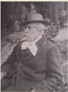
Fig. 1. Anonymous, Edmond de Goncourt in his garden, c. 1895. Photograph on albumen paper. Paris, coll. Christian Galantaris.

After the opening of economic and cultural trade between Japan and Europe and the United States in 1854, a predominant view of Japanese art and culture as fundamentally different from their European equivalents began to dominate nineteenth-century European commentaries. For example, in an 1867 article, Zacharie Astruc spoke of "this Orient, so different from us." Japan's difference was exactly what made it so exciting to Astruc, who was enthusiastic about the "new inspiration" that could be drawn from "this far away people." 1 In 1868, Jules Champfleury agreed on the essential difference of Japanese art, but he condemned the growing fascination with its "bizarre use of color," as he described the impact of James McNeil Whistler's enthusiasm for Japanese lacquer-ware and kimonos. He argued that the American artist made paintings "so bizarre that they troubled the eyes of the naive men who sought positions on...exhibition juries." 2 Champfleury ultimately feared that France was "threatened with a Japanese invasion in painting." 3 These positions reflect what Gabriel P. Weisberg has described as a dualism between two quickly emerging camps: those who feared Japanese influence and those who embraced its potentially liberating aesthetic. 4 Regardless of whether European critics liked or disliked Japanese art, however, their comments presupposed Japanese exoticism and difference. 5