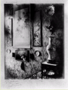
Fig. 2. Fernand Lochar, Vestibule of the Goncourts' house in Auteuil, June, 1886. Photograph on albumen paper. Paris, coll. Frits Lugt, Institut Néerlandais.

positions, which primarily concerned France and not Japan. In order to fully understand his analogies, we must place them into the context of French aesthetic debates, rather than merely dismiss them as inaccurate, fanciful, or wrong about Japan and its artistic culture. 7 Goncourt's preferred aesthetic criteria were increasingly being sidelined in both contemporary avant-garde painting and in the art critical and art historical literature of the period. His writing on Japanese art therefore attempted to reinforce the value of aesthetic qualities he felt were neglected or unrecognized by his contemporaries. Far from a simple, uncomplicated "passion for" Japanese art, Edmond de Goncourt's embrace of it reflected a diverse range of personal and socio-cultural interests. 8