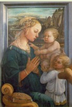
Fig. 8. Filippo Lippi, Madonna and Child , c. 1455. Tempera on wood. Florence, Galleria degli Uffizi.