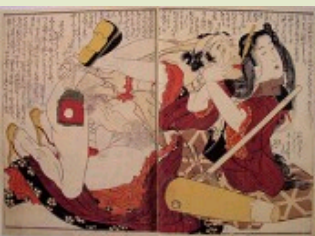
Fig. 9. Katsushika Hokusai, Lovers from Kinoo no kamatsu [Young Pine Saplings] , 1814. Polychrome ink and color on paper. Cologne, Pulverer Collection, Inv. 187.

“indescribable voluptuousness, [...] the floating elegance of a hand by Primaticcio.” 60 The “force” and “power” of the linearity of phalluses in Japanese erotic prints “equaled” Michelangelo’s drawing of a hand, owned by the Louvre (figs. 9 & 10). 61 In these comparisons to Italian art 62 —rarer than the eighteenth-century French references—Goncourt may have taken a certain delight in the quasi-blasphemous surprise generated by his juxtapositions.