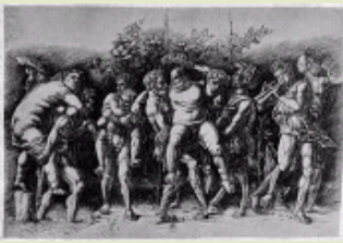
Fig. 6. Andrea Mantegna, Drunken Silenus , c. 1470. Engraving. New York, Metropolitan Museum of Art (29.44.15).