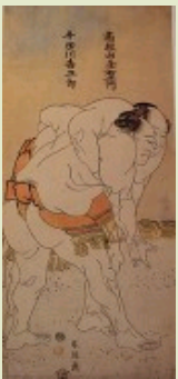
Fig. 5. Katsushika Hokusai, Sumo Wrestlers: Takaneyama Yoichiemon and Sendagawa Kichigur? , 1788. Polychrome ink and color on paper. New York, Metropolitan Museum of Art.

Such a conclusion, however, would only be a partial explanation of what was at stake in the analogies, and would miss their deeper symbolic and rhetorical functions as they related to Edmond's positions in the aesthetic debates of late nineteenth-century France. Whatever else Edmond's motivation, one of the goals of his writing was to train European viewers to see and appreciate the subtle beauty of Japanese art. 56 In order to explore the way Goncourt's comparisons actively participated in establishing or confirming his aesthetic positions, it is helpful to examine another group of analogies. Goncourt identified a wide variety of formal affinities between Japanese and European art, not all of which had to do with eighteenth-century France. 57 Of the non-French comparisons, the most interesting in terms of their ideological function are the parallels he constructed with Italian Renaissance art. Hokusai's nudes, he claimed, "have something of a Mantegna," 58 (figs. 5 & 6) and Utamaro's nursing mothers evoked images of the Virgin Mary bending towards the infant Christ in Renaissance Madonnas (figs. 7 & 8). 59 Often, the comparisons took on a surprising, even shocking, allure. The hand of a masturbating woman in a Hokusai print had the