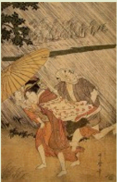
Fig. 3. Kitagawa Utamaro, Shelter from a Sudden Storm , c. 1779-80. Polychrome ink and color on paper. Tokyo National Museum, inv. 3538.

Long before Edmond met Hayashi, however, he and his brother Jules began to make connections between Japanese and French culture. 20 Edmond and Jules had the opportunity to see Japanese ink drawings (as opposed to the more common prints) firsthand in the Siebold collection in Leiden in 1861. Comparing the drawings favorably to sketches by Fragonard, the Goncourts first established parallels between these two cultures by claiming that the Japanese drawings “have the wit and picturesque touch of an ink drawing by Fragonard.” 21 Three years later, they insisted that Japanese prints and paintings by Watteau were both “drawn from the intimate study of nature,” and argued that, in spite of their fanciful appearance to European eyes, Japanese prints were based on observation and rendered “what the Japanese artists saw.” 22 Edmond ultimately described Utamaro as the “Watteau of over there,” 23 because both artists exhibited a sustained preference for female subjects. The phrase le Watteau de là-bas at once asserted an equivalency that characterized the Japanese artist using a French artist’s name, while at the same time underscoring his geographic distance. Crucial elements of Goncourt’s comparative criteria thus take shape: wit and art based in the direct observation of reality that transcribes life “as it was lived.”