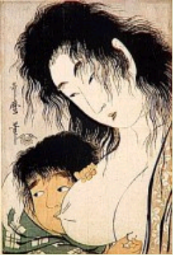
Fig. 7. Utamaro, Yumauba and Kitaro Suckling , 1801-03. Polychrome ink and color on paper. Paris, Musée Guimet.