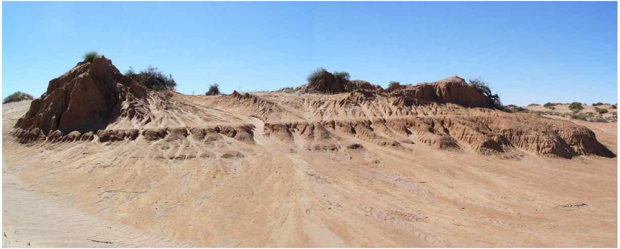
Figure 2: Rilled erosion of remnant dune by water and reworked Aeolian sediments in left foreground.