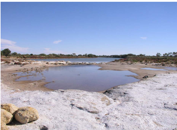
Figure 5: Looking upstream of the Umbum Crossing floodwaters dam against outcrop of Eyre Formation. The outcrop provides a more erosionally resistant substrate in the creek bed and forms a nick point in the fluvial profile.