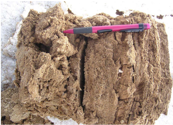
Figure 9: Parallel laminations of mud, silt and fine-grained sands on the delta front.