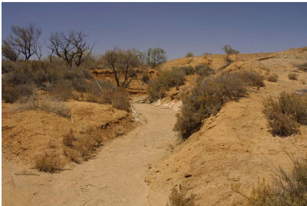
Figure 3: Small fluvial channel incising and eroding into gibber plain adjacent to the main channel.