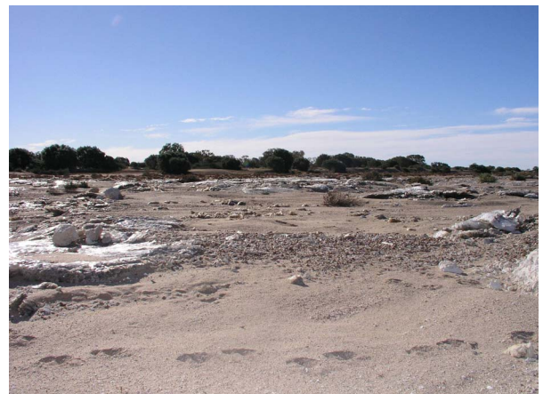
Figure 6: Superman's Palace, an informal name for this site where the top of the Etadunna Formation outcrops in the base of the Umbum Creek channel, forming an erosionally-resistant substrate and the next nick-point downstream of the Umbum Crossing. gypsum crystals of up to several metres across, celestite and palygorskite all outcrop and the assemblage of mineral is indicative of a drying-up, sulphate-rich, alkaline lake.