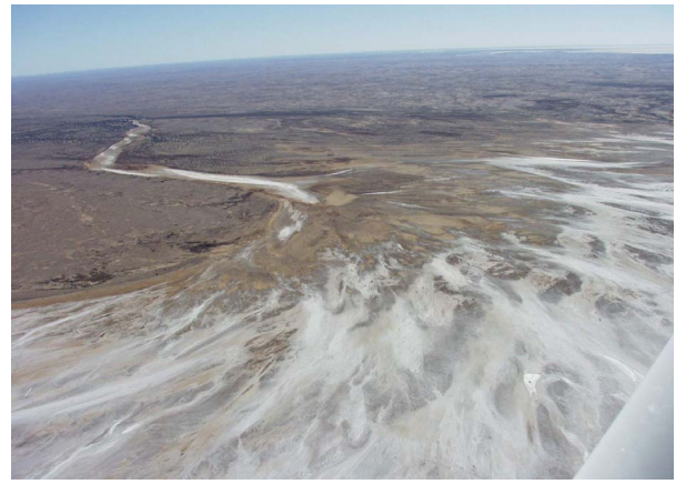
Figure 10: Aerial photo of the Umbum Delta.