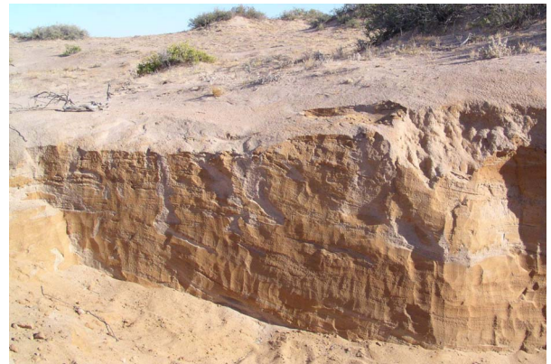
Figure 4: Remnant Aeolian dune crosscut showing air escape structures (pale sands) in an otherwise mud-cemented dune. Mud cement most likely due to turbid floodwaters infiltrating dune under hydrostatic pressure.