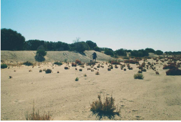
Figure 7: > 1 m high avalanche front cross-stratified simple barforms exit the end of chute channels that cut across point bars during elevated flood levels.