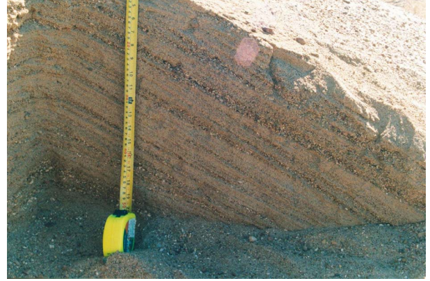
Figure 8: Internal bedding of avalanche front cross-stratified beds.