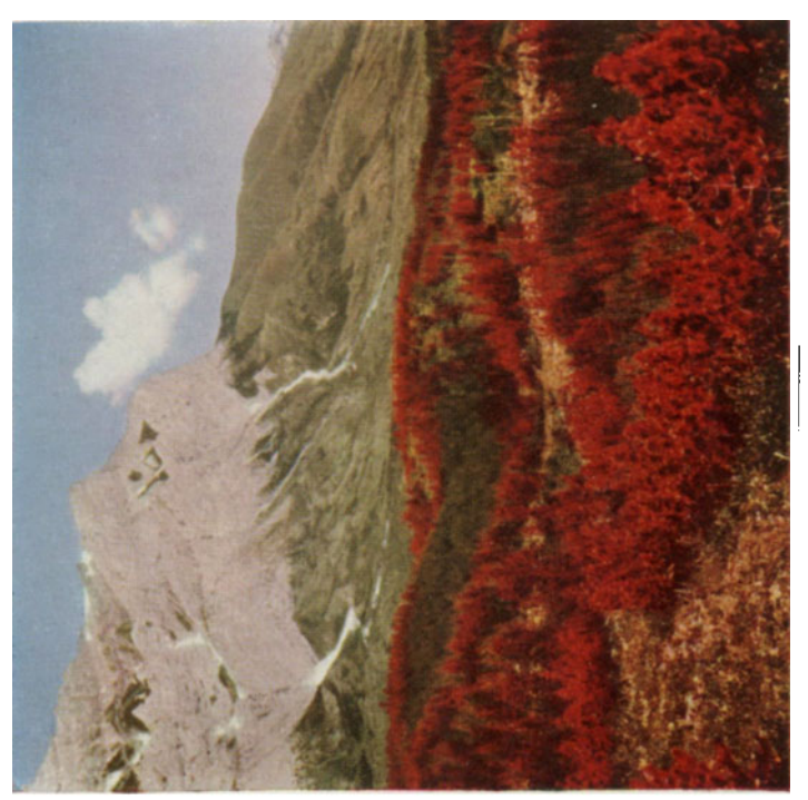
Fig. 2. Looking north-west showing variation of injury with topography; the north-east aspect escaped injury