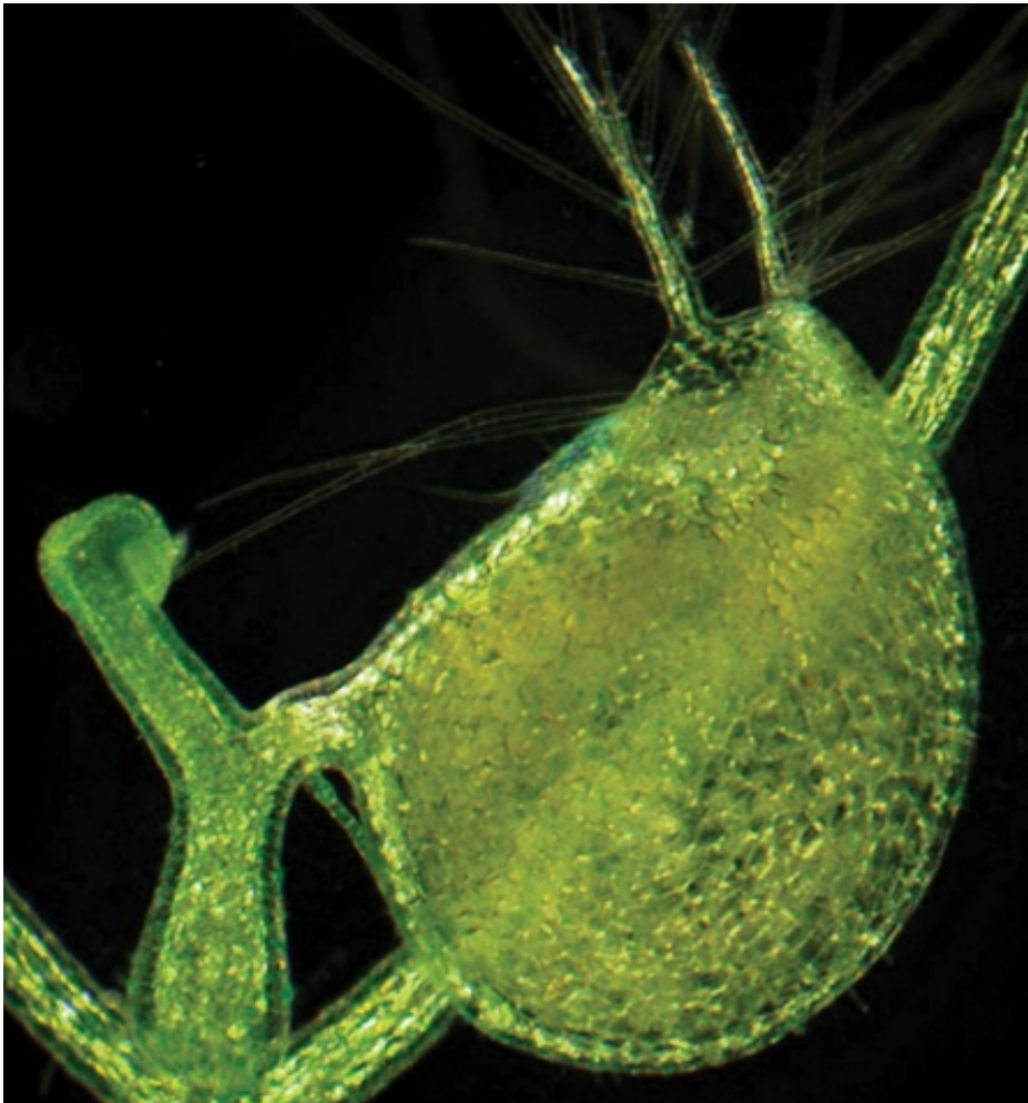
Light micrograph of the bladder of Utricularia gibba, the humped bladderwort plant (color added).