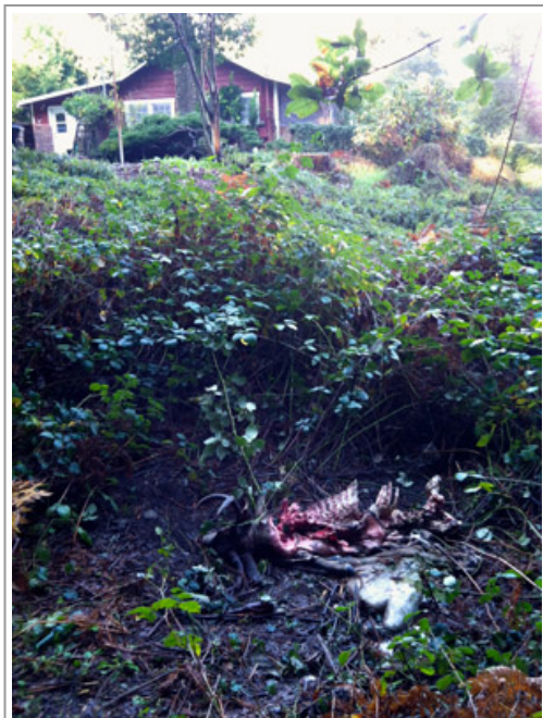
The remnants of a deer killed by a puma are visible within view of a semi-rural home. UC Santa Cruz researchers have found that pumas are more likely to abandon a kill when it's near human habitation.