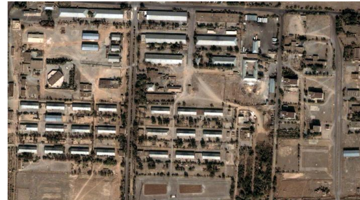
Figure 2. The original image

The described methodology has been applied on QuickBird multi spectral images of an urban area in Isfahan city (figure 2). As observed, this image includes buildings with different size, roof, shape and arrangement.