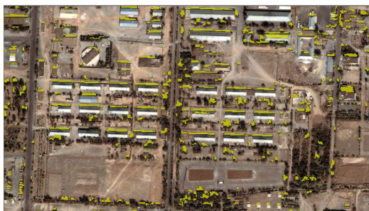
Figure 5. Detected shadows

Further, variable features that lead to optimal building detection are extracted by SEparability and THresholds tool. The feature analyzing tool SEaTH identifies characteristic features with a statistical approach based on training objects. These training objects represent a small subset out of the total amount of image objects and should be representative objects for each object class. The statistical measure for determining the representative features for each object class is the pairwise separability of the object classes among each other. Subsequently, SEaTH calculates the thresholds which allow the maximum separability in the chosen features (Nussbaum et al., 2008). Here, choosing training samples of building class and other classes in the image such as vegetation, road, wasteland, etc, features that result in optimal separation of probability distribution function between building class and other classes (two by two) are determined as optimal features with appropriate threshold.