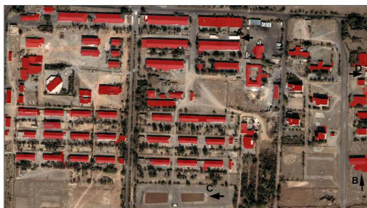
Figure 6. Resulted image

features together, it could not be accomplished as shown in the below image (figure 6).