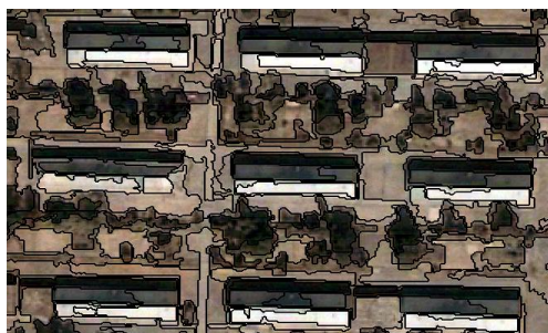
Figure 4. Subset of segmented image