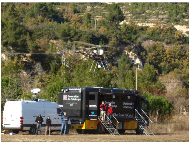
Figure 4: Unmanned Aircraft and Control Station on November, 25th -the first CLOSE-SEARCH test campaign

The results were satisfactory from the overall integration point of view, and particularly for the remote sensing component. With respect to the latter, several targets were deployed on the field (ground targets, human, etc.) and the UAS/UA flew over them. The goal was to validate the proposed GSDs to enable body recognition using thermal images and, as described in section 2.2, this goal was achieved. Nonetheless, on the navigation/control tasks, no performance results were obtained as the equipments were used on the acquisition mode and thus no UAV control tasks were performed using the EGNOS-based navigation solution.