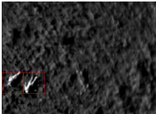
Figure 3: Two persons lying on the floor, sensed with a GSD of 5cm x 5cm, and the AFD mechanism providing its detection

As the thermal camera resolution is of 320 x 240 pixels, and that is quite low, one may think on taking advantage of the large image forward-overlap (acquisition frequency ranging from 4 Hz to 25 Hz) to enhance its performance. This can be achieved by the so-called super resolution which yields sensibly high improvements and can thus improve the system performance (Almeida and Tommaselli, 2003).