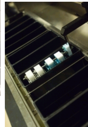
A machine in Hammond's laboratory used to make fuel-cell membranes.