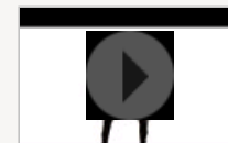
Gareth Pugh A/W '09 Trailer