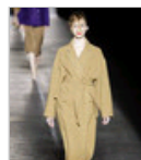
Dries Van Noten