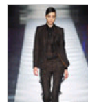
Jean Paul Gaultier