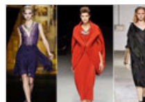
New From Paris: Lanvin, Christian Dior, Issey Miyake, and More