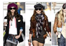
Fug Girls: Keep Homeless Celebrity Chic Off the Runways