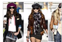
Fug Girls: Keep Homeless Celebrity Chic Off the Runways