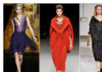
New From Paris: Lanvin, Christian Dior, Issey Miyake, and More