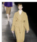
Dries Van Noten