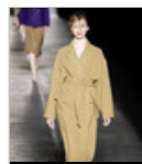
Dries Van Noten