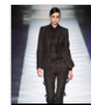
Jean Paul Gaultier