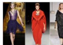
New From Paris: Lanvin, Christian Dior, Issey Miyake, and More