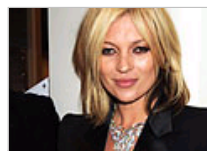
Kate Moss Will Cut the Topshop Ribbon on Thursday Morning