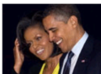
MObama Has Landed — and She Changed Into Chartreuse Jason Wu!