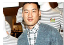
Bill Blass to Return in September, Possibly Designed by Richard Chai