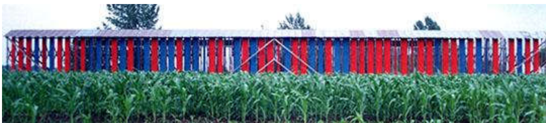
Wind Gate , Temporary Cities project.