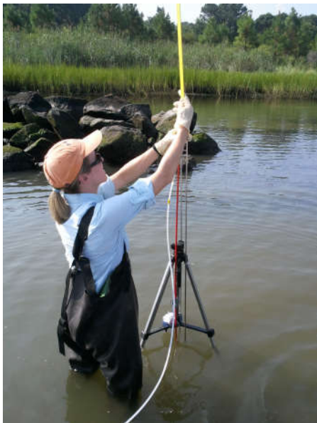
Sawyer sampling contaminants from the sea bottom.

In contrast, another 9 percent of coastline—including confirmed locations such as Southeastern Florida, Southern California, and Long Island—are especially susceptible to the opposite threat: contamination from sea to land, the study found. In these areas, saltwater intrudes inland and infiltrates the fresh groundwater supply.