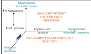
Fig. 2. Three dimensions to investigate (Dien, 2006).