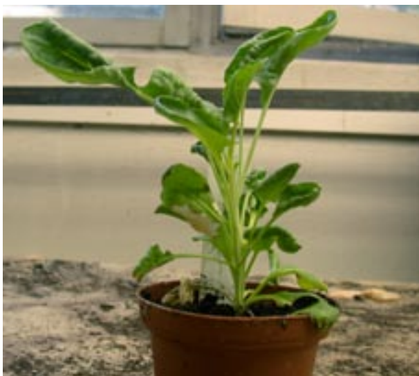
Figure 6. B. oleracea abnormal plant bearing curly leaves

From various modifications of induction medium, media E and E1 produced regeneration frequencies of about 70% in B. oleracea but in the case of B. napus the regeneration frequency was very low (3%). Medium E2 induced stem-like structures