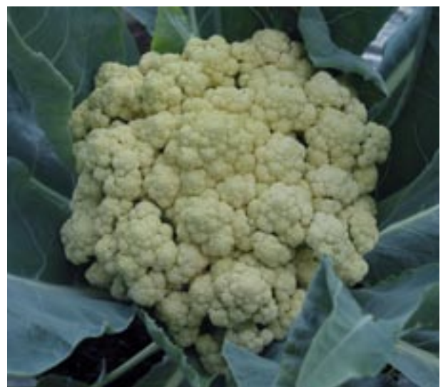
Figure 7. B. oleracea plant generated from protoplast with normal head

The regeneration of plants from protoplasts is a prerequisite for their utilization in crop improve-