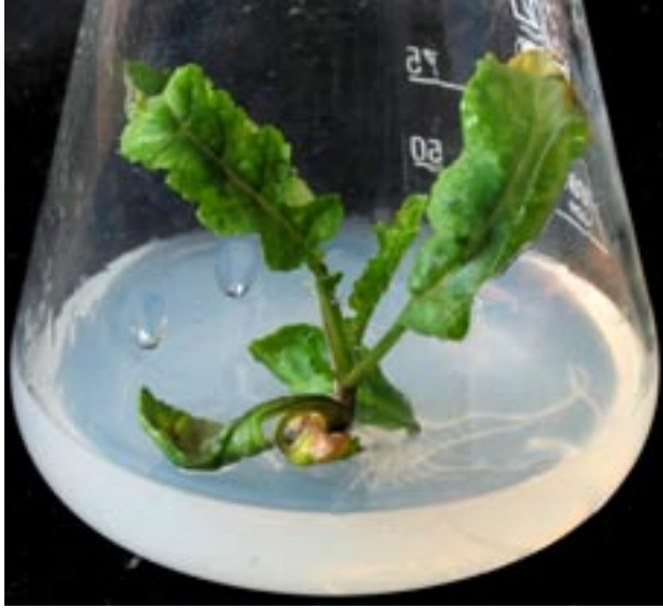
Figure 5. Plant regenerated from the protoplast derived callus in B. oleracea developing roots

or MS without growth regulators. Medium E is essential for the induction of shoot regeneration in developing calli. The shoots were transferred to half-strength MS medium for rooting and for prevention of vitrification (Figure 5). In B. oleracea all the developed shoots regenerated into whole plants whereas in B. napus the plant regeneration efficiency was 45–50%.