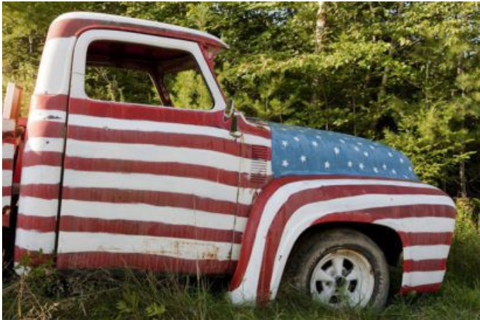
A resurgence of ‘redneck’ pride, marked by...