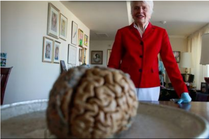
Gift, movie highlight brain scientist’s legacy