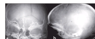
Figure 1: X-ray of the skull, ...