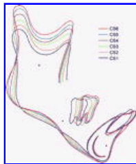
Figure 3. Composite tracings of the six stages of cervical vertebral maturation. Superimposition is on the tantalum implants. Note that the largest increment of condylar growth occurred between stages CS3 and CS4. Note also the forward and upward movement of the molar and the primarily forward movement of the incisor

Click on thumbnail for full-sized image.