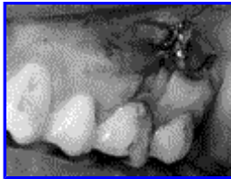
FIGURE 3. Implant is fixed with three screws

Click on thumbnail for full-sized image.