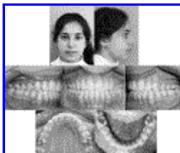
FIGURE 6. Extraoral and intraoral photographs of the patient before treatment

Click on thumbnail for full-sized image.