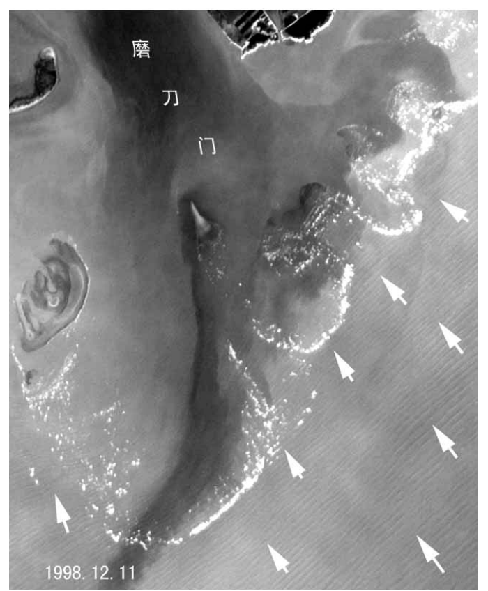
Fig. 3 Waves and their broken phenomenon near the sand-bar at Modaomen

mixing region where due to the flocculation effect the sediment settles down quickly. The flocculated sediment could move along the sea bed near the mouth with the current. Part of this sediment is brought to the area near the mouth bar by the deep circulating flow and settles down, and other part joins upper-lays and continue to circulate. The sediment mainly settles in the front of the mouth bar and forms the underwater delta. The some fine sediment and flocculated sediment can be brought to the southern-western area by the transverse coastal flow and become one of the sediment sources of the Jitimen outlet and the Huangmaohai Bay.