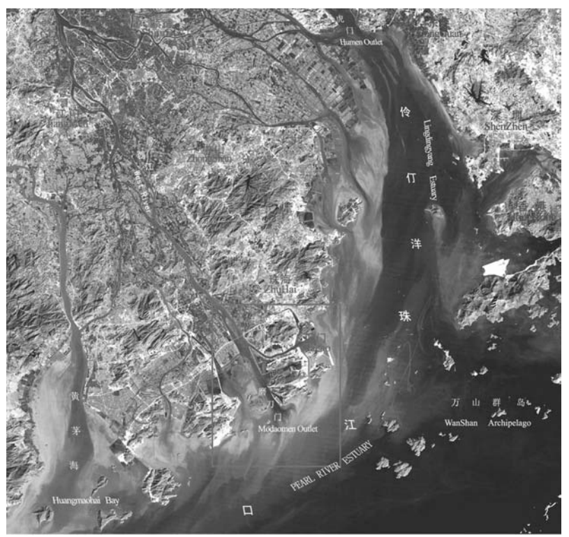
Fig. 1 Ilustration of Modamen outlet and its situation at Pearl River Estuary