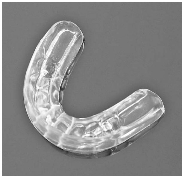
Figure 1. Prefabricated eruption guidance appliance (Occluso-Guide, Ortho-Tain Inc).