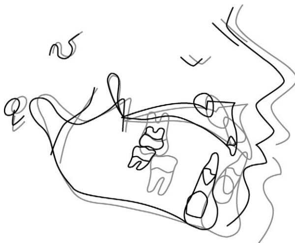
Figure 3. Treated child (JT) before (6.1 years) and after (8.9 years) treatment with eruption guidance. Superimposition on Frankfort horizontal at pterygoid verticale.

the eruption guidance appliance. 9 Complete age cohorts of children were screened in the deciduous dentition, and orthodontic intervention with the eruption guidance appliance was carried out in the mixed dentition in children showing a tendency to Class II occlusion, crowding, increased overjet or overbite with lack of tooth-to-tooth contact between the incisors, anterior crossbite, and/or buccal crossbite (scissors bite). A comparison with an untreated control group with similar malocclusions revealed that an efficient Class II