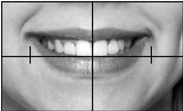
Figure 1. A standardized smile image using the 3-in \times 5-in template.

of this sample size with respect to correlation tests (Type I error = 0.05). For a bivariate normal distribution and a sample size of 48, a test of H_0: P = 0 (ie, the correlation coefficient under the null hypothesis) was found to have a power of 0.80 to detect a linear correlation of r = 0.38 . Thus, the default sample size for the Q-sort procedure was deemed adequate for purposes of testing for correlation.