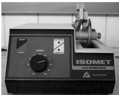
FIGURE 2. Low-speed saw.

by a high-intensity quartz tungsten halogen (HQTH)-curing unit occurs rapidly. Conversely, some authors do not indicate the use of high-intensity light units based on the fact that this type of unit induces higher polymerization shrinkage and larger residual stress in dental filling composites. 7,8 In recent years, many different methods have been studied aiming to reduce the effects of polymerization shrinkage, ie, use the different light-activation techniques such as pulse delay, 9 soft-start cure, and pulse cure, 9 development of resins that do not shrink when they polymerize 10 or that expand through a double-ring open process, 11 and the use of the incremental filling technique. 12,13 However, in the orthodontic literature, few studies exist concerning the differences in polymerization shrinkage of orthodontic adhesive resins irradiated using conventional and high-intensity halogen-curing systems.