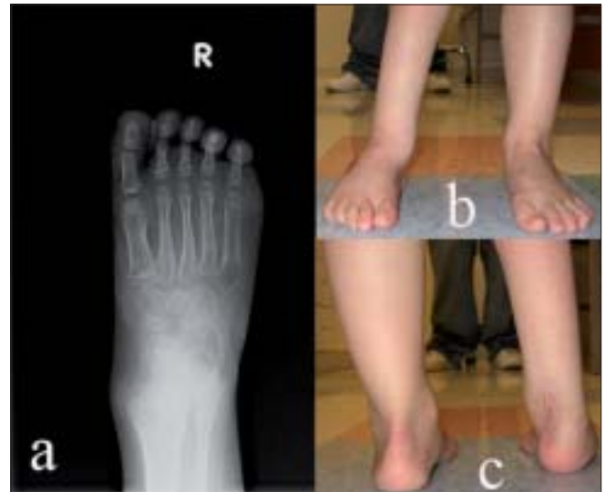
Figure 2: Clinico-radiological deformity correction of the same patient after treatment with manipulation, Achilles tendon lengthening and tibialis anterior transfer. (a) Postoperative AP X-ray of foot with ankle depicting correction of forefoot adduction. (b,c) Clinical appearance of right foot after treatment

Many studies have shown poor long-term function after surgical treatment of clubfoot. 18-23 They are frequently stiff, painful and have limited range of motion. Recurrences are usually treated with further surgery, however, this only