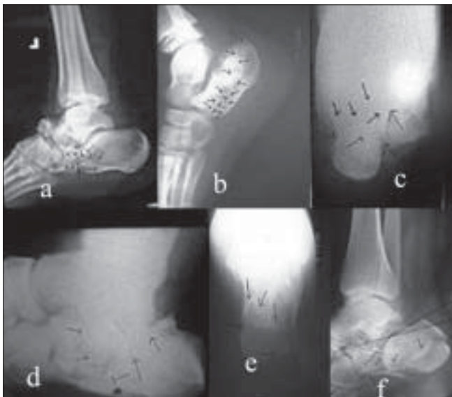
Figure 1: X-rays showing the fracture patterns of secondary fracture line (a) calcaneocuboid type of anterior secondary fracture lines, (b) plantar type of anterior secondary fracture lines, (c) Type A of posterior secondary fracture lines pattern, (d) Type B of posterior secondary fracture lines pattern, (e) Type C of posterior secondary fracture lines pattern and (f) Type D of posterior secondary fracture lines pattern

Preoperative data were recorded related to associated injuries, the height from which the patient had fallen, type