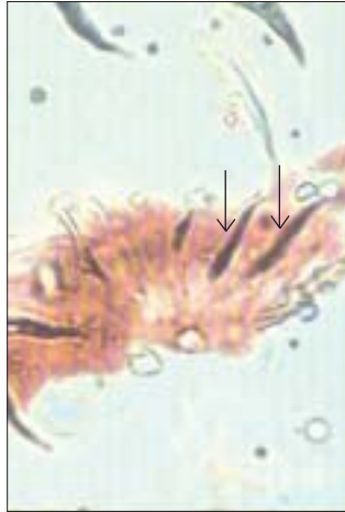
Figure 2: Photomicrograph (100X) of bone tissue showing scolex

An ultrasound of the abdomen was later performed and did not reveal hydatid cyst in the lung or the liver. The patient was treated with albendazole for three cycles at a dose of 400mg twice a day for four weeks followed by a two-week rest without therapy. 10,11 The patient was followed for one year with no recurrence of the lesion.