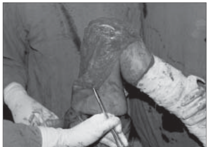
Figure 2: Peroperative flexion achieved

Patients profile, complications and results are discussed in detail in Table 1. Average range of preoperative flexion was