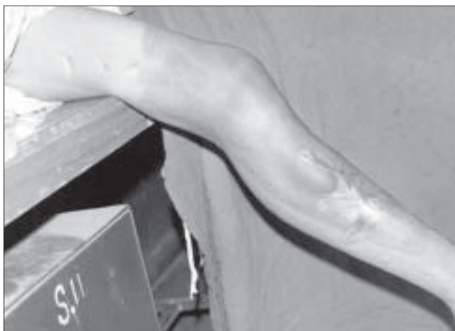
Figure 3a: Preoperative flexion 15°

Quadricepsplasty is the recommended procedure for release of severe knee extension contracture. The post traumatic knee stiffness can impose a severe handicap