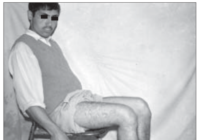
Figure 3b: Postoperative flexion 95°