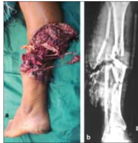
Figure 3: (a) Clinical photograph of leg with severe crushing of soft tissues with absence of a vascular injury. (b) X-ray of left leg bones (AP view) was showing comminuted fracture tibia with bone loss. MESS has poor sensitivity for amputation. Attempted salvage of this leg wound have led to prolonged surgeries and probably a secondary amputation. In contrast, Ganga Hospital Score was 17 indicating the need for amputation. In IIIB injuries, Ganga Hospital Score was more sensitive than a MESS in predicting amputation

The NISSSA score has been found to be more accurate than MESS. 29 However, the idea of placing too much weightage on loss of plantar sensation at presentation 19 or even later 30 has been criticized. Severe crush injuries of limbs may have an associated crush neuropraxia or minor avulsion injury of the posterior tibial nerve, which will improve spontaneously. In acute traumatic conditions, it may often be impossible to differentiate recoverable or permanent damage to the nerve. A false assessment of the plantar sensation loss may result in unnecessary amputation. It has been argued that a very functional limb can be obtained with proper rehabilitation and appropriate footwear even in the presence of a complete irreparable damage to the posterior tibial nerve. 19