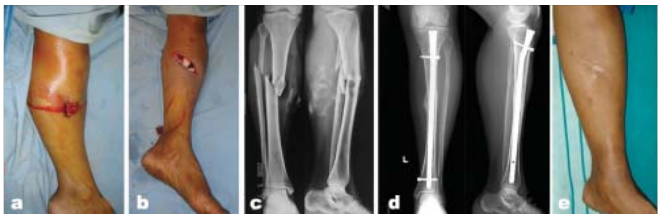
Figure 5: (a & b) Clinical photograph showing open injury of the tibia with exposed bone. (c) X-ray anteroposterior and lateral views of leg bones showing comminuted fracture of tibia. As per the Ganga Hospital Score, the total score is less than 5 and the skin score is less than 3. (d) X-ray anteroposterior and lateral view of leg bones showing skeletal fixation and union. (e) Clinical photograph showing result after immediate skin closure and a thorough debridement leading to good result