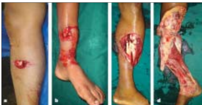
Figure 2: Clinical photograph of four different injuries, (a-d) which are all Gustilo IIIB by definition. Management and outcome of all these injuries, although grouped together under IIIB, are completely different

The mangled extremity severity score (MESS) was reported