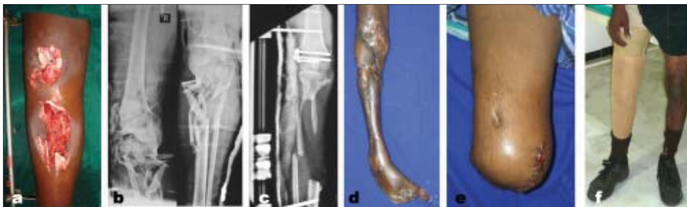
Figure 1: (a) Clinical photograph shows severe open injury of tibia with soft tissue loss. (b) X-rays (anteroposterior view) showing severe comminution of the bones in proximal 1/3rd of tibia. (c) X-ray (anteroposterior view) showing gap non-union upper end tibia. (d) Clinical photograph of same patient showing an infected non-union with sinuses and a deformed foot. (e) Clinical photograph of same patient showing above-knee amputation. (f) Clinical photograph after rehabilitation

Limb Salvage Index (LSI); 16 the Nerve Injury, Ischemia, Soft Tissue Injury, Skeletal Injury, Shock, and Age of the Patient (NISSSA) score; 17 the Hannover Fracture Scale-97 (HFS-97), 18 and the Ganga Hospital Open Injury Severity Score (GHOISS) 19 [Table 1].