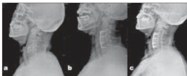
Figure 1: Measurement of three segment cervical lordosis. (a) Preoperative (17°) (b) Postoperative (24°) (c) At bony union (18°)

[Figure 1]. Any hardware failure was recorded regardless of the significance or surgical outcome. At final follow-up, the clinical outcome was recorded according to Odom's criteria 12 [Table 3].