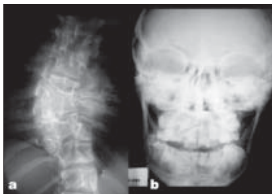
Figure 2: Case 2 (a) Dorsal spine X-ray film showing scoliosis, block vertebrae and hemivertebrae. (b) Skull X-ray film showing crowded teeth

syndrome is reportedly high in Turkey. 7