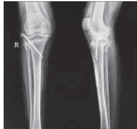
Figure 2: X-rays soon after HTO showing K wires and lateral and posterior ledges from the proximal segment. Note slight anterior positioning of tibial tubercle from the distal fragment

millimeters. Having obtained the desired correction of 7° valgus and 5° of external rotation, two Kirschner's (K) wires (usually 2-mm thick) are passed from the superolateral part of tibia crossing the site of osteotomy to engage the medial cortex of the distal fragment for further stability [Figure 2]. The bones harvested during the operation are used as bone grafts and packed around the site of osteotomy. The wound is closed in layers over a suction drain. The limb is put in a plaster cast from mid-thigh to the ankle.