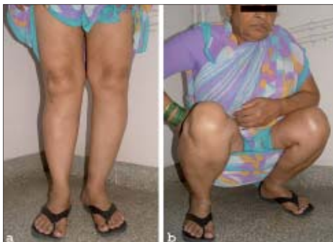
Figure 4: Clinical and functional result of the HTO done on right knee, 6 years after operation