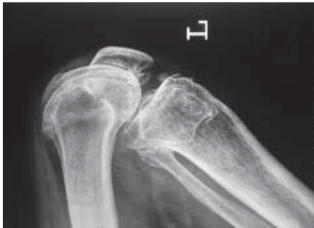
Figure 3: This patient was operated at 64 years of age. Now at 73 years of age, 9 years after HTO the patient has full range of knee flexion