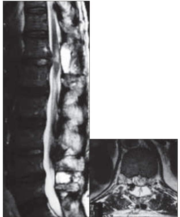
Figure 2: T2W MRI sagittal and axial images at 1 year followup showing expansion of cord and myelomalacia

In 95%, the lumbar spine is affected and the commonest levels are L3-4 and L4-5. The incidence of intradural herniation decreases as one proceeds towards the lumbosacral junction. It is suggested that, narrower lumbar canal at higher levels may predispose for a higher lumbar localization of intradural herniations. 1 Rarely, intradural migration in the cervical and the dorsal spine has been reported to produce compressive myelopathy. To our knowledge, D12-L1 intradural disc herniation causing conus medullaris syndrome has not been reported in the literature.