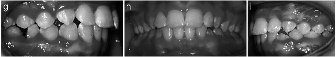
FIGURE 1. (g)–(i) Seventeen months after hemisection. Space is nearly closed and ready for removal of the mesial half; midline is still unchanged.