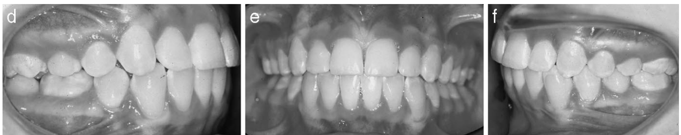
FIGURE 2. (d)–(f) Following 13 months of braces, the midline has been easily restored and spaces are closed.

The net molar corrections were statistically significant with more molar relation correction for the hemisection cases than the premolar extraction groups. There were no statistically significant differences in overjet change.