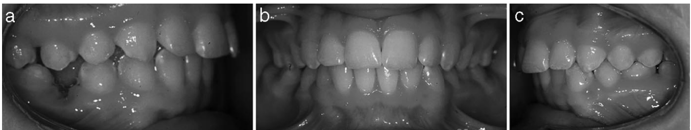
FIGURE 2. (a)–(c) Ready for fixed appliances; note that, only 8 months following the removal of the mesial “bookend,” the midline is beginning to shift toward the extraction.