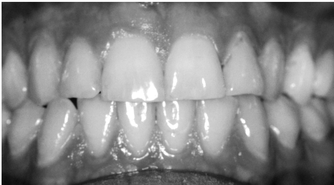
FIGURE 2. The maxillary canines have been palatally retained and are, five years after treatment, easy to identify as previously palatally retained canines.

B and the impacted canines in groups A and C. Three teeth (nos. 21, 22, 23) in group B were involved, and one patient caused this significant difference between the groups. In the other patients, the periodontal variables had normal values.