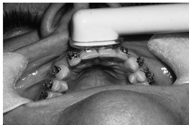
FIGURE 3. Using the new LED light, two brackets can be cured simultaneously.

The present findings indicated that the shear bond strength of the orthodontic adhesive obtained when using the LED light-curing device for 20 seconds was not significantly different from that obtained when the brackets were