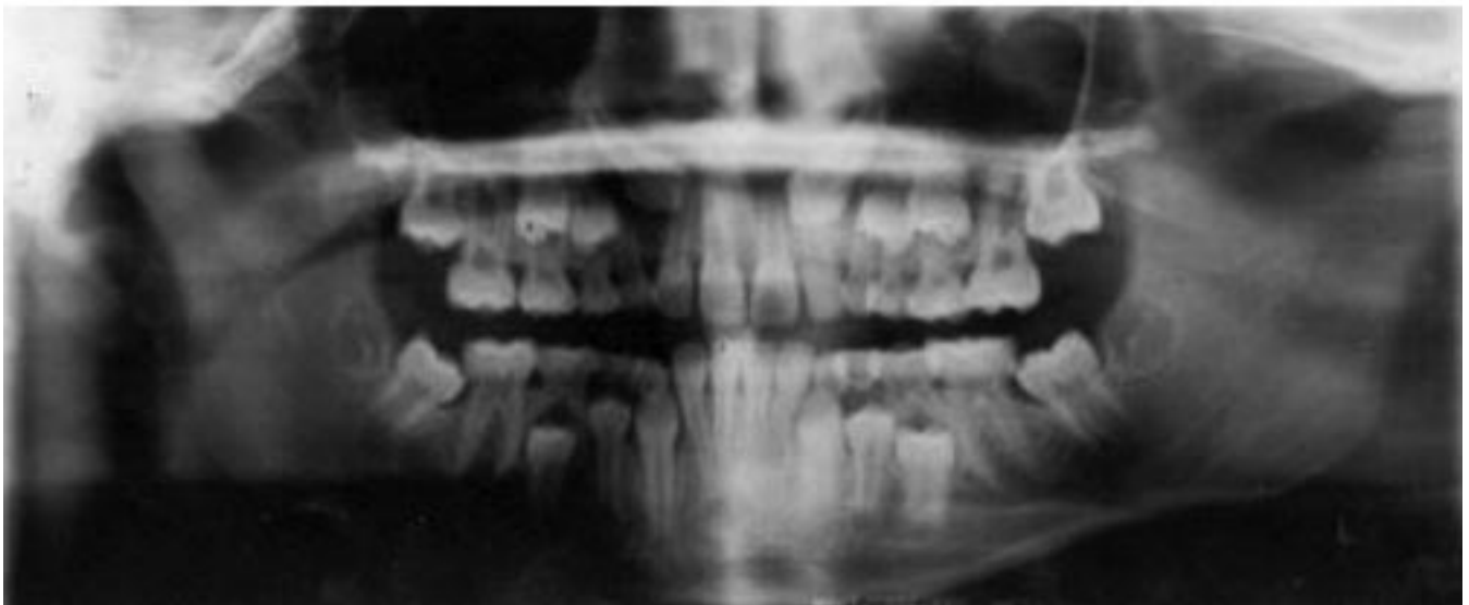
FIGURE 2. Panoramic radiographs, initial, at age 10.7 years. (a) MZ twin ES, (b) MZ twin DS.

served over a 15-month period, with only a facebow headgear in place for part of the time on the maxillary first molars to assure that no space loss occurred after extraction. Panoramic dental radiographs taken again at the age of 12 years indicated partial success of the PDC interception procedure: twin ES showed relatively normal eruption of the right maxillary canine and an impacted palatal displacement of the left one, whereas twin DS showed the left maxillary canine in nearly normal position and the maxillary right canine impacted palatally (Figure 3a,b). Thus, at this point,