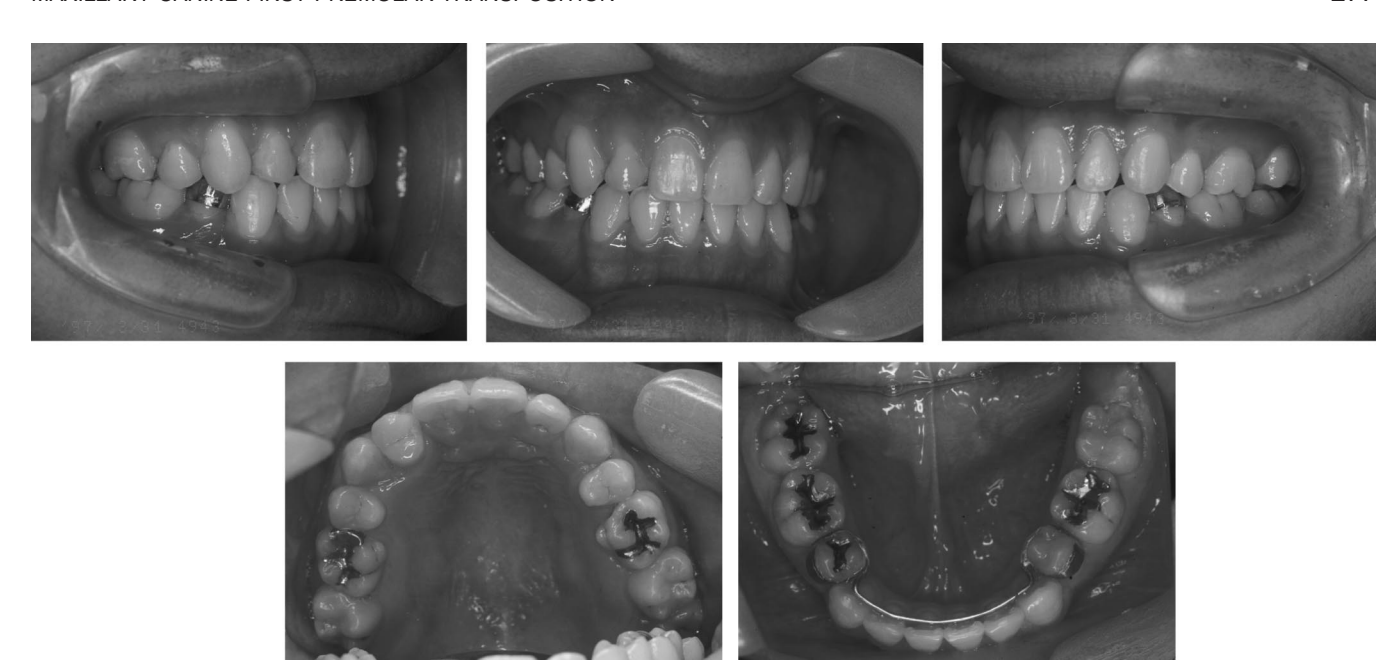
FIGURE 3. Posttreatment intraoral views.