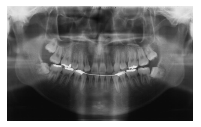
FIGURE 4. Posttreatment panoramic radiographs.

Frankfort horizontal plane ( 110.0^{\circ} to 107.2^{\circ} ), L1 to the mandibular plane ( 92.4^{\circ} to 88.0^{\circ} ), and FMIA ( 56.3^{\circ} to 63.3^{\circ} ), probably due to the extraction of the first premolars.