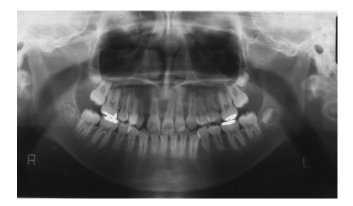
FIGURE 2. Pretreatment panoramic radiograph.

a maxillary removable retainer and a mandibular lingual fixed retainer were placed for retention.