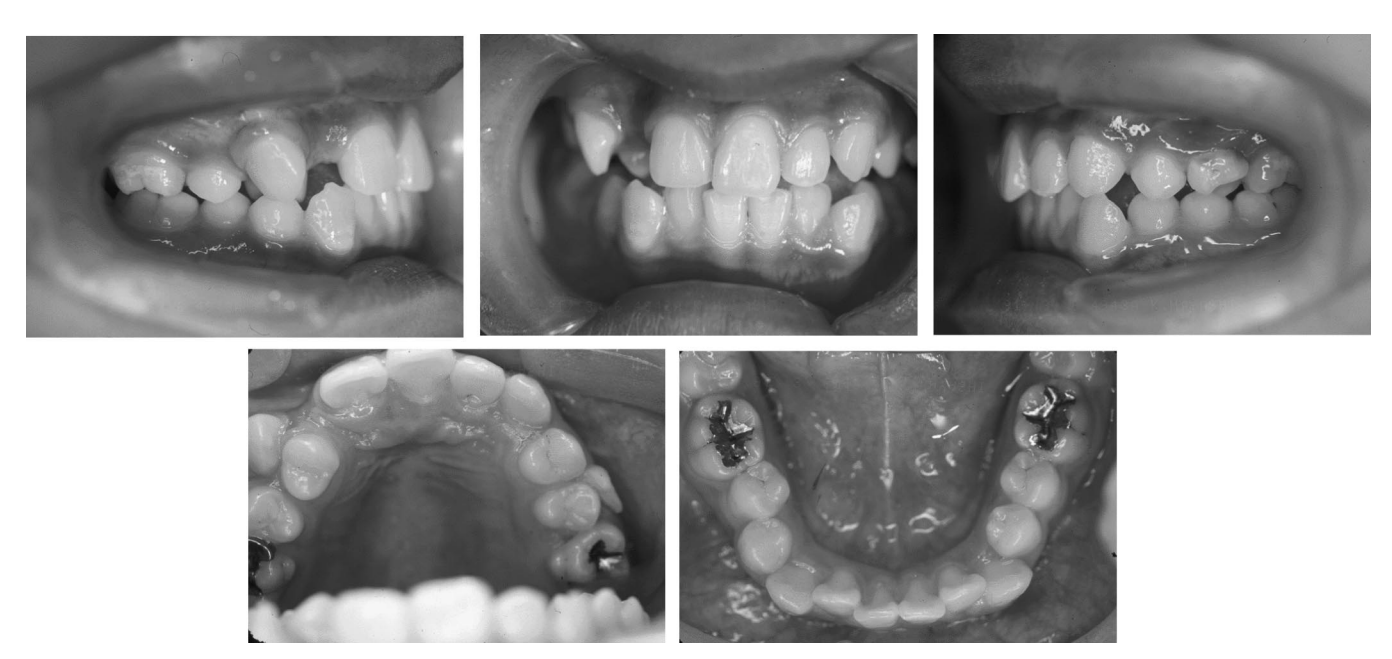
FIGURE 1. Pretreatment intraoral views.