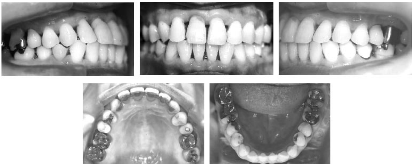
FIGURE 7. Postretention intraoral photographs, age 60 years two months.