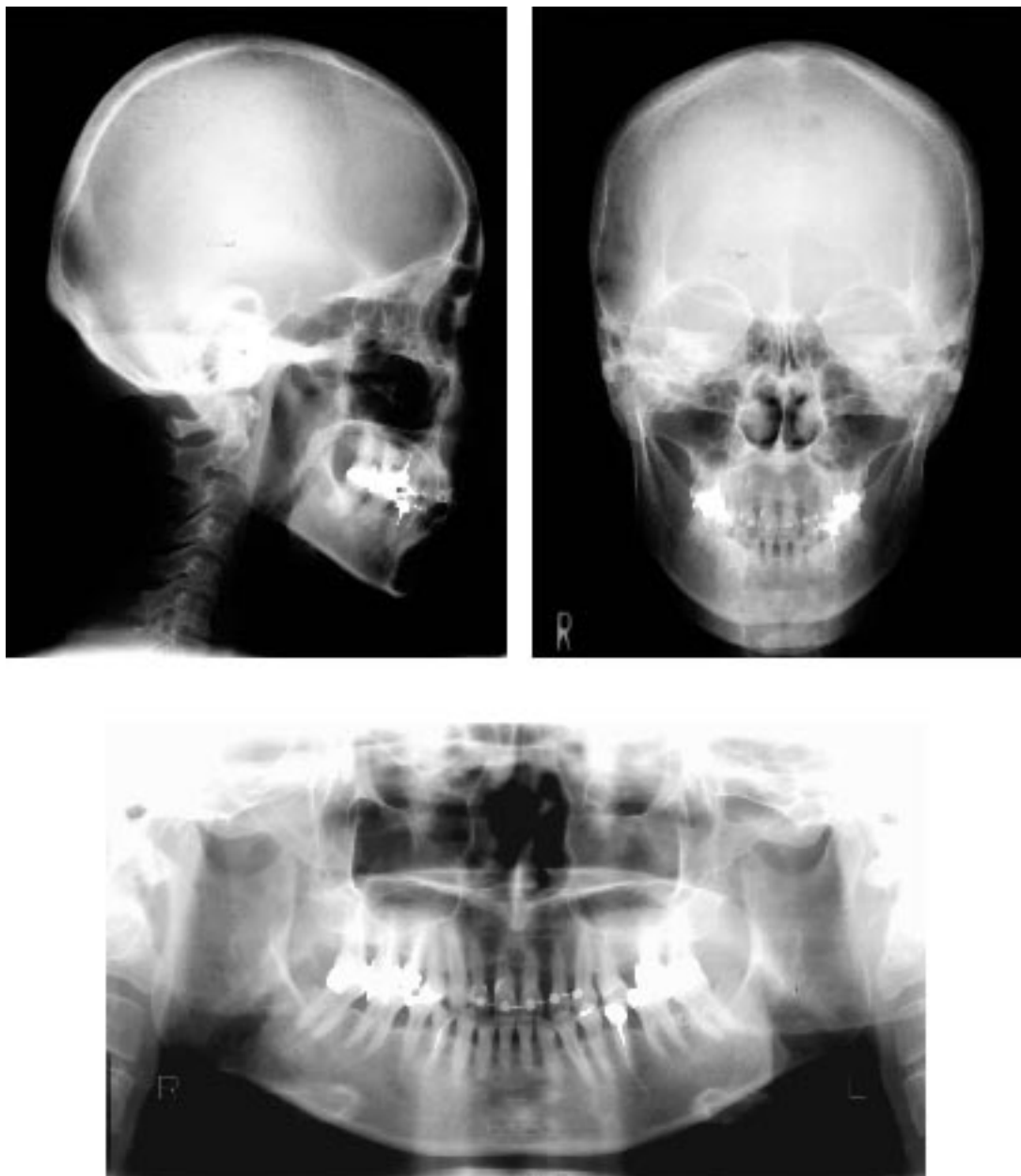
FIGURE 2. Pretreatment radiographs.

terior region as was a lateral anterior crossbite on the left (Figure 1). Spaces were present on the mesial and distal sides of the maxillary left first premolar because of the missing maxillary left second premolar. A lingual fixed wire bonded to the five maxillary anterior teeth was present. The mandibular anterior teeth were mildly crowded. The dentition showed generalized gingival recession but with no pockets greater than three mm and normal mobility. Radiographic examination revealed generalized moderate bone loss (Figure 2). No signs or symptoms of temporomandibular disorder were noted despite the occlusal dysfunction due to the missing maxillary left second premolar.