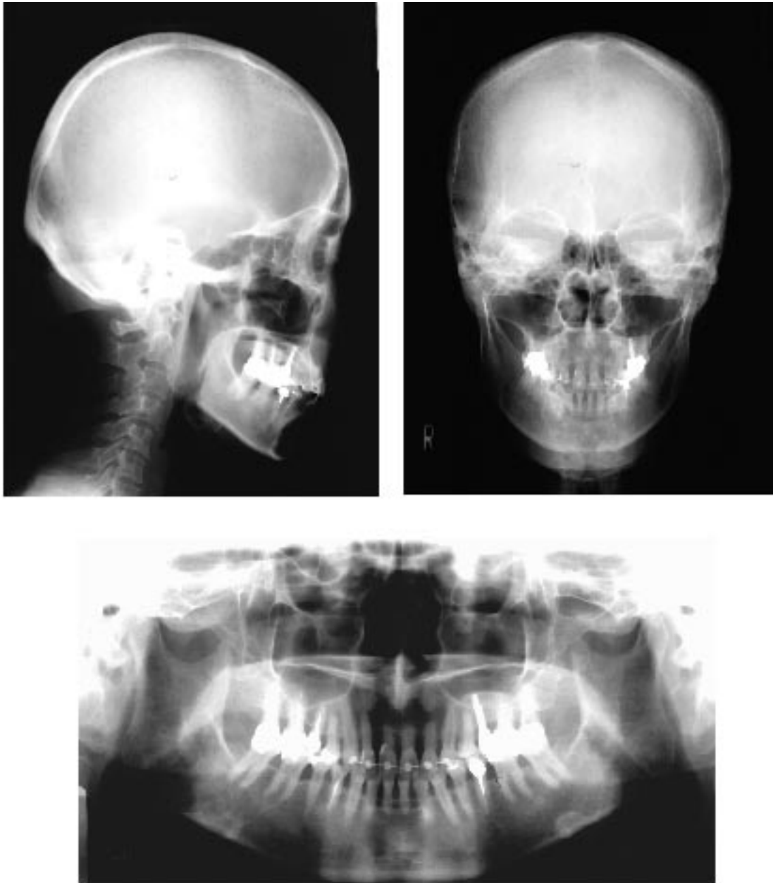
FIGURE 8. Postretention radiographs.

teeth and to create favorable conditions for oral function and hygiene maintenance.