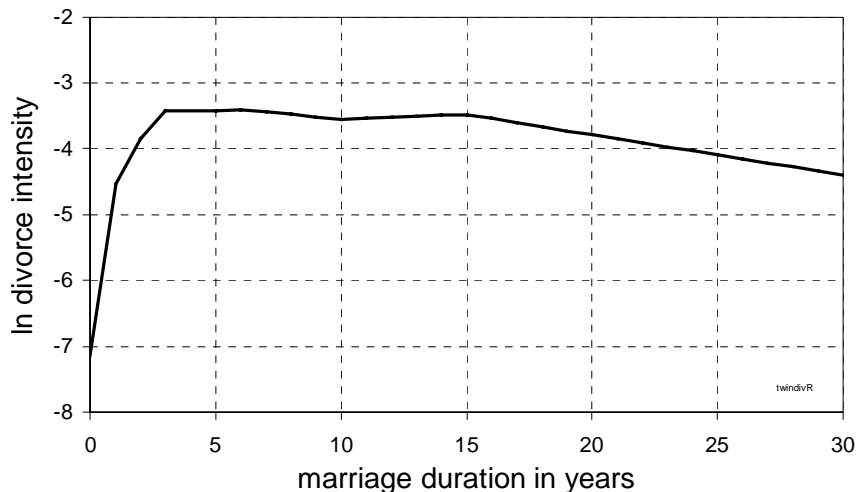
Figure 1: Divorce risk per year for Swedish women, by duration of first marriage.

Figure 2 shows the logarithmic effect of the calendar year on the divorce intensity. It uses a baseline year of 1980 and the baseline intensity mentioned above. In order to show that legal changes introduced in the early 1970's have different impacts on different groups of women, we divided women into two groups: (a) with a premarital child and (b) without a premarital child. The black curve denotes women who had not given birth before marriage, while the grey curve shows the calendar effect for women who had at least one child before marriage. The divorce risk (black curve) increases rapidly between 1970 and 1973. This could be the result of a general value change regarding marriage and divorce. There is a jump upwards at the end of 1973, which may have been caused by the liberalisation of the divorce law in Sweden at that time (Sveriges Riksdag 1973). Before 1973, there were possibly an unknown number of couples waiting for better conditions to get divorced. After 1973, there is a slower increase in the risk until 1990. The grey curve does not have the same jump intensity.