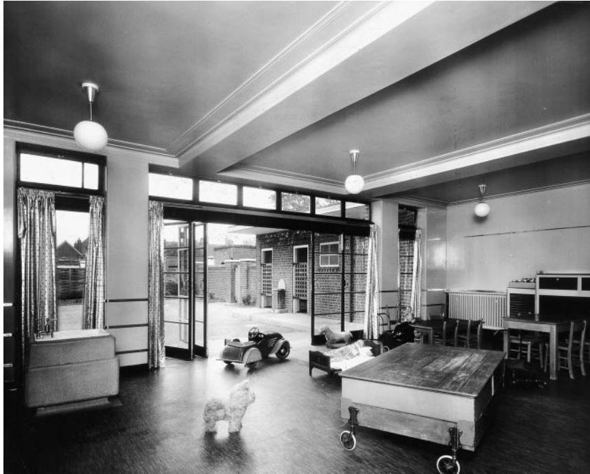
Figure 4: The playroom for the children's outpatients department, photographed in 1939.

paratyphoid, and dysentery” from spreading in asylums. He also advocated investigation of the endocrine system, which served as “the foundation of the nervous condition of the body”. 85 This strategy had the welcome side-effect of drawing psychiatry within the ambit of general medicine and, if successful, would have raised the status of its practitioners. “The value of this steady scientific research into the physical disorders underlying mental illness”, Mott concluded, “is unquestioned”. 86 The focal sepsis hypothesis was pursued with enthusiasm by some medical superintendents, notably Thomas Graves at Rubery Hill and Hollymoor mental hospitals, where he encouraged patients to undergo surgical procedures to remove teeth, sinuses and tonsils, while other anti-infective initiatives included vaccinations, continuous colonic lavage and ultra-violet light treatment. 87