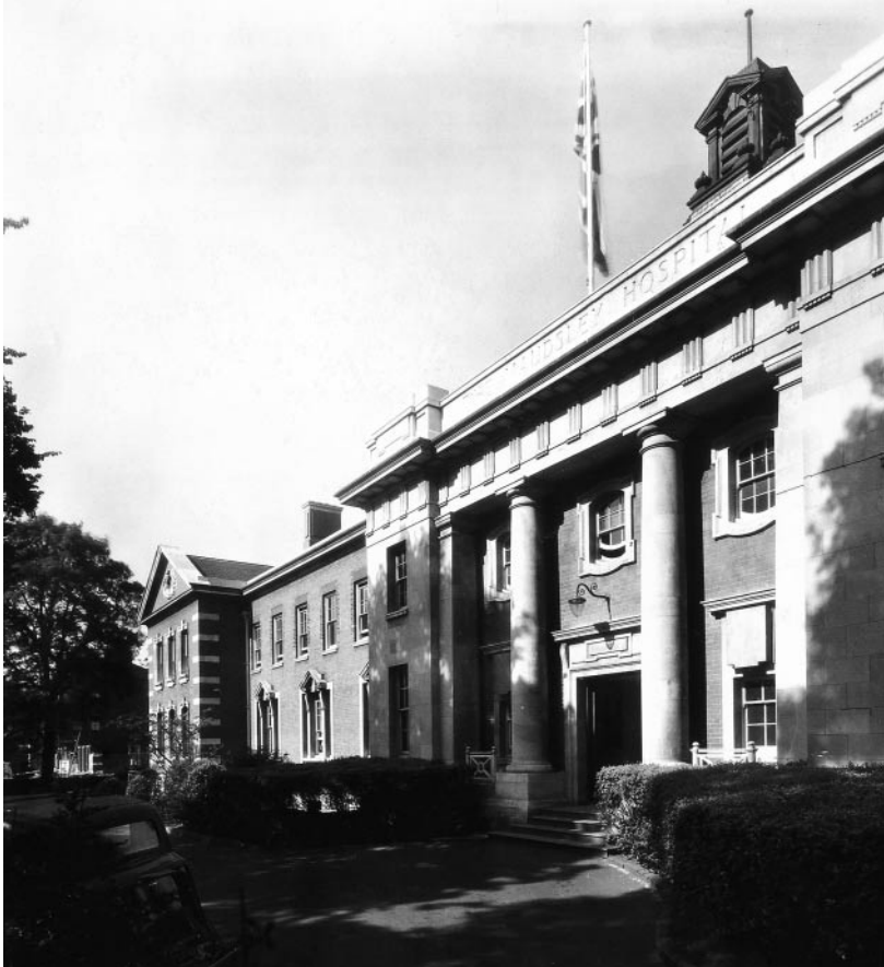
Figure 2: The main entrance to the Maudsley Hospital, photographed in May 1935. The buildings were designed by the LCC’s mental hospitals engineer, William C Clifford Smith, FRIBA.

asylums” and that “great gain would accrue from the acquisition of knowledge in regard to the causes of insanity and its prevention”. 25