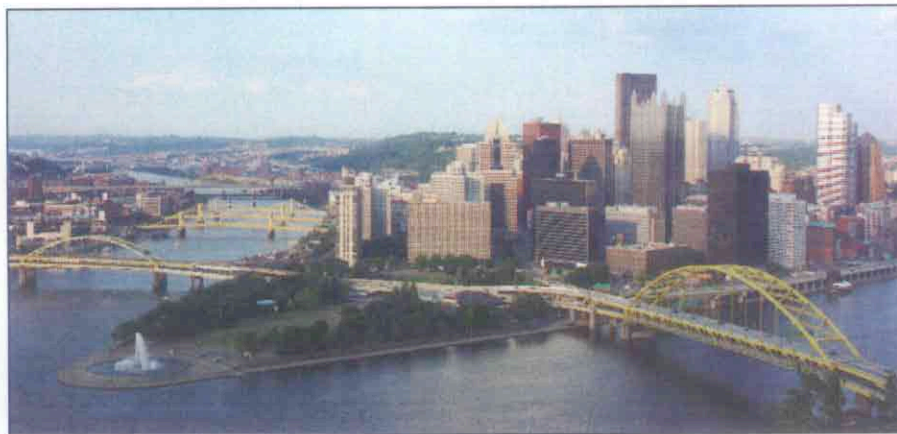
View of “the Point” and downtown Pittsburgh, Pennsylvania, from Mt. Washington.

Before steel production, the United States depended on Pittsburgh for glass. At one time, 62 glass factories decorated