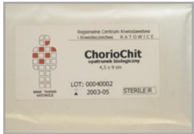
Figure 2. ChorioChit dressing in sterile package.

As a result of cooperation between the Institute and Viscoplast Co, Wrocław, a technology was elaborated to produce chitosan fibres for dressings [10-13]. Chitosan staple fibres that can be made according to the method lend themselves to the manufacture of a non-woven for wound-healing dressings. Due to changes introduced in the production profile of the Viscoplast company, the manufacture of the fibres was implemented in the Institute of Chemical Fibres in Łódź.