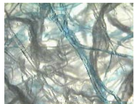
Figure 3. The surface of the PP/chitosan non-woven Chitosan fibres blue tinted.

In cooperation with the Institute of Textile Engineering in Łódź, investigations were made to prepare dressings containing chitosan as a carrier of kyotorphin with analgesic properties. The dressing is given the form of a sponge or film, to be used on open wounds, scalds and ulcers.