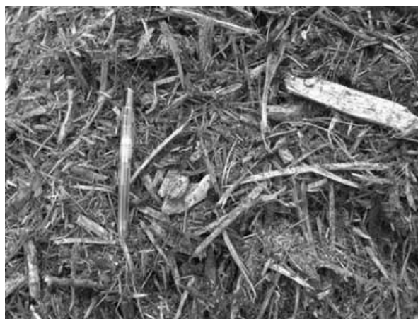
Fig. 4 Processed wood chips

Although the moisture content of logging residues to be comminuted and the screen size opening of a tub grinder would influence the productivity of the tub grinder, only one instance (120.4% of mois-