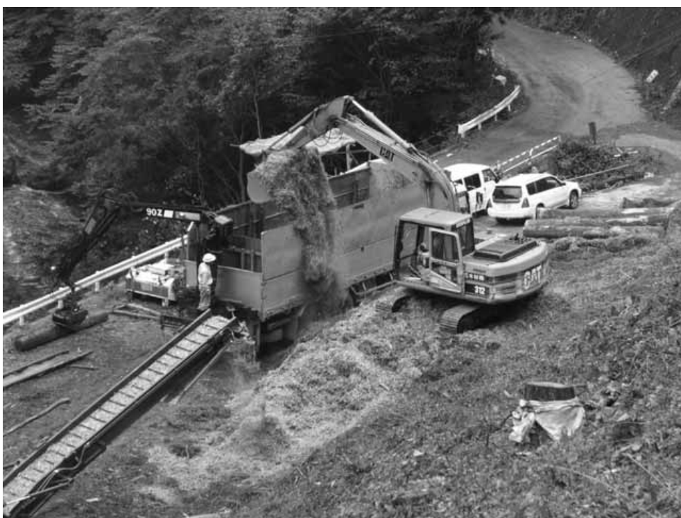
Fig. 3 Bucket loader