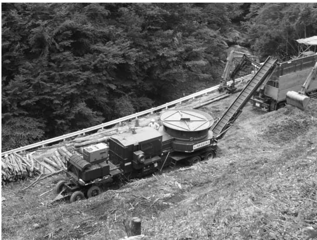
Fig. 1 Tub grinder