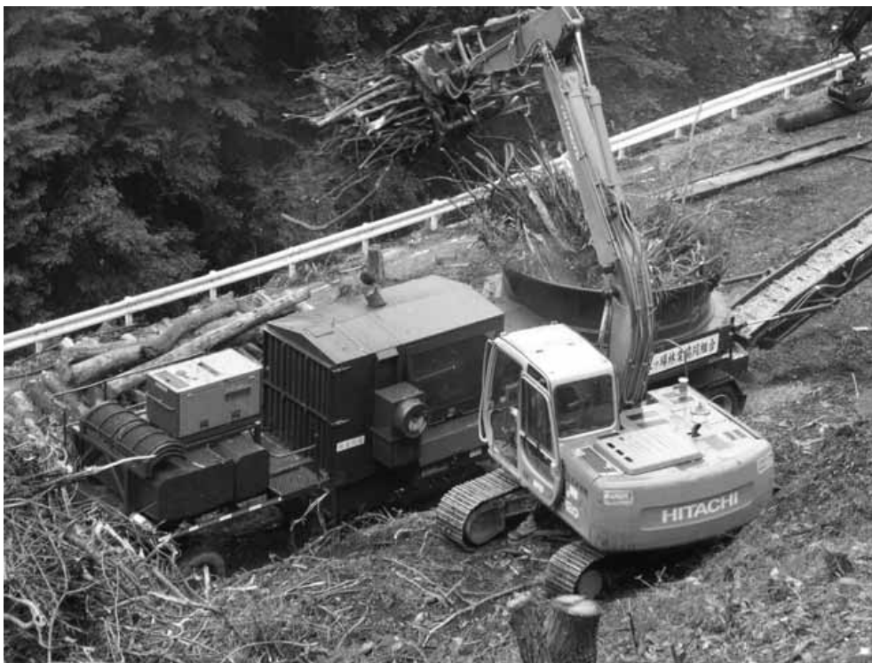
Fig. 2 Grapple loader